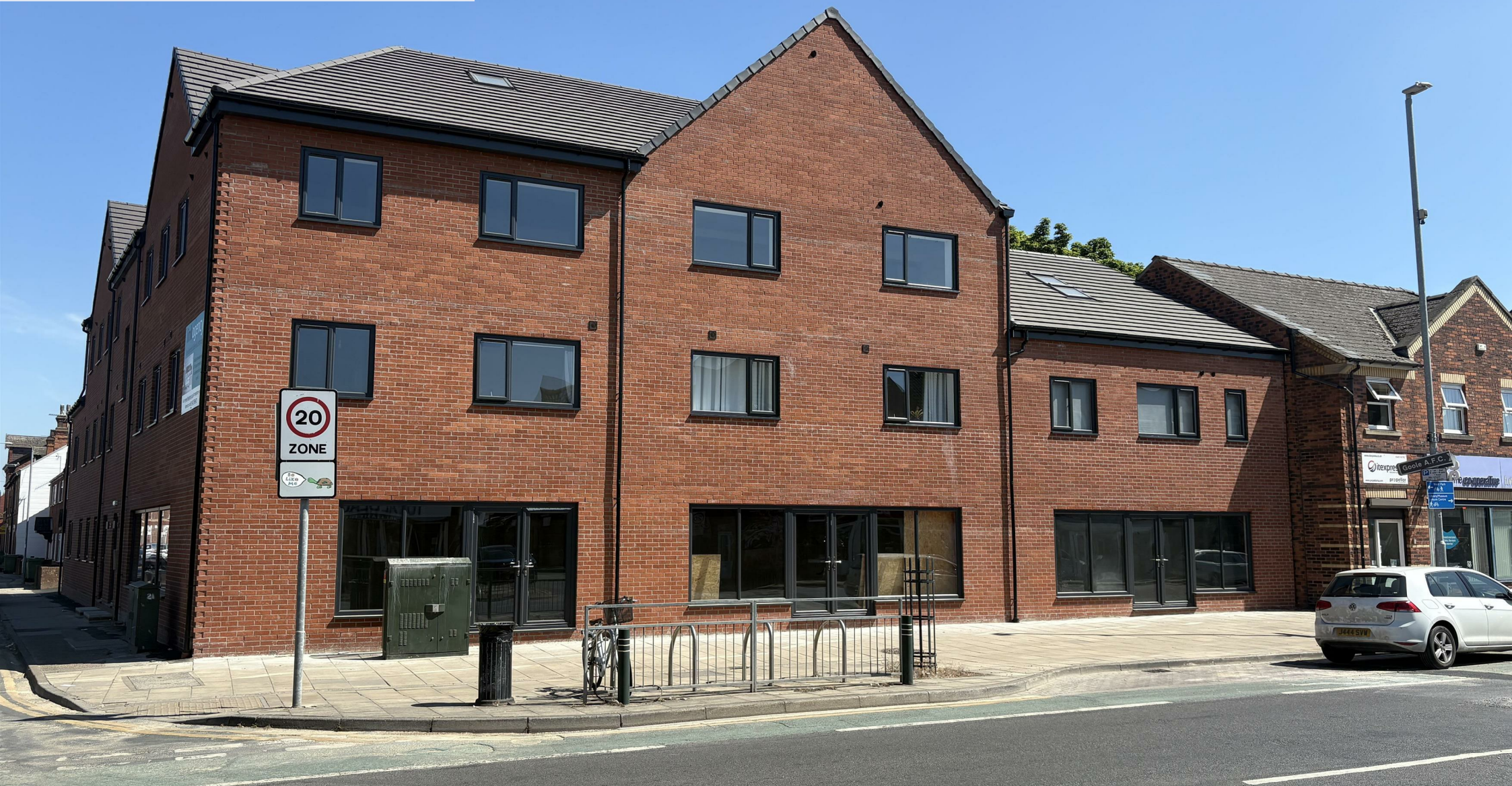
Carlton Apartments, Goole, DN14 6DG